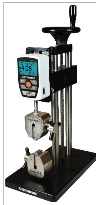
Shown with an ES20 test stand and G1061 wedge grips

The gauges include MESUR Lite data acquisition software. MESUR Lite tabulates continuous or single point data. One-click export to Excel allows for further data manipulation.